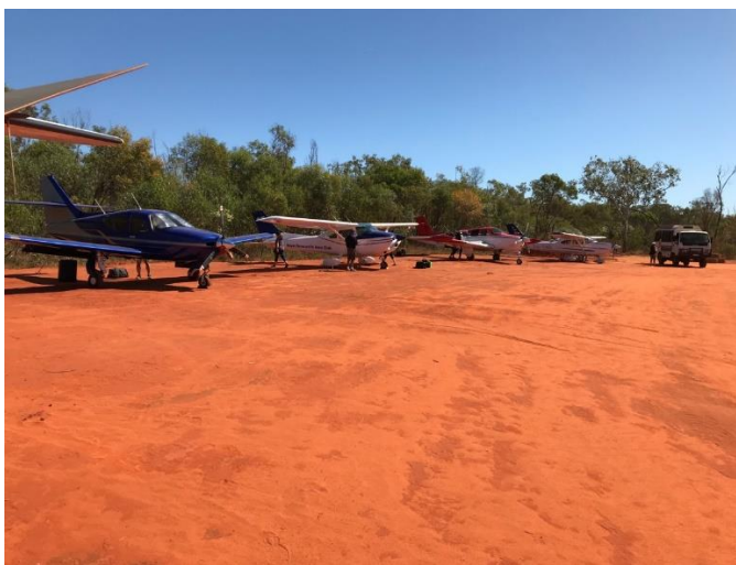
^^ Photo: Aircraft parking at Cygnets Bay