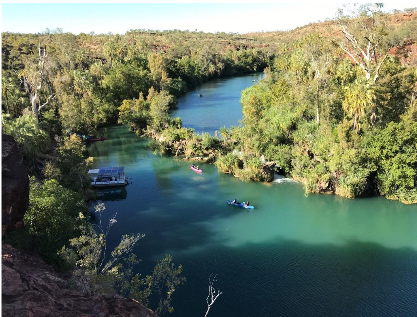
^^ Photo: Gregory River, Adells Grove