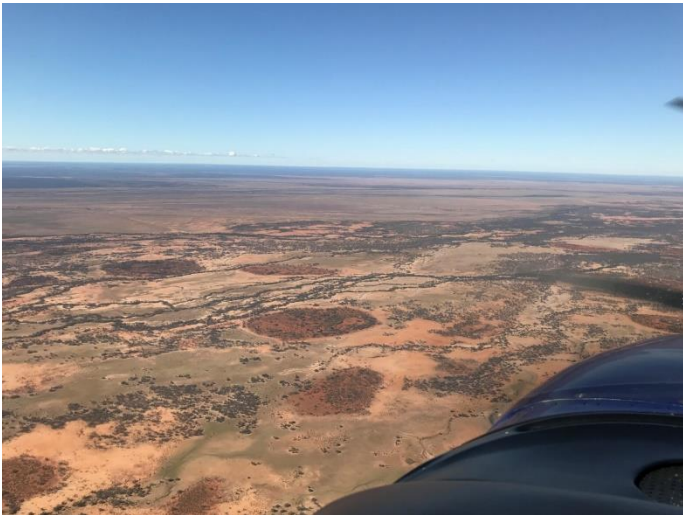
<<< Photo: between Adells Grove and Winton

We departed Adells Grove for Winton for an overnight stay and a re-fuel before flying onto Thargomindah for the last overnight stay of our trip before heading for home.