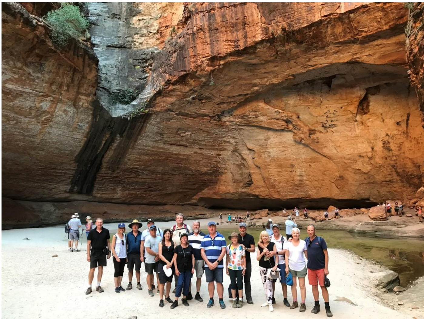
^^ Group photo at Cathedral Gorge