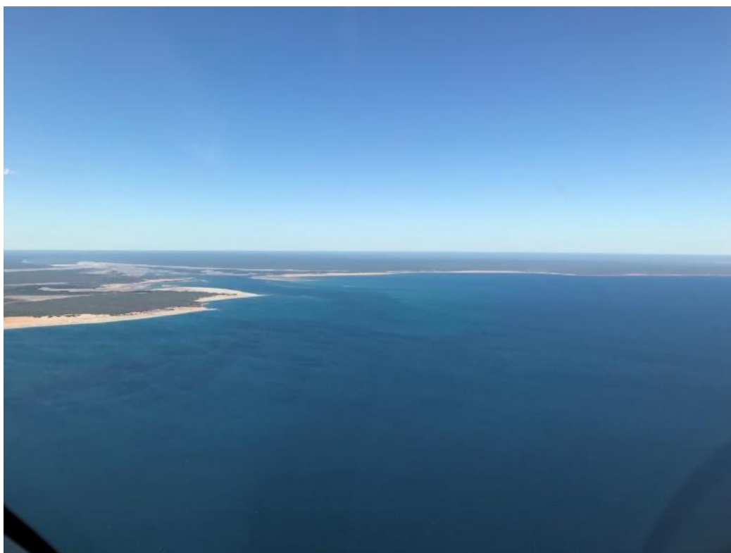
<<< Photo: WA coastline

There was another early start with a scenic flight down the West Coast before turning left for Derby to re-fuel and a quick plane wash. Then we were off to Mt Elizabeth Station for two nights in the middle of the WA outback for a little river fishing and relaxation.