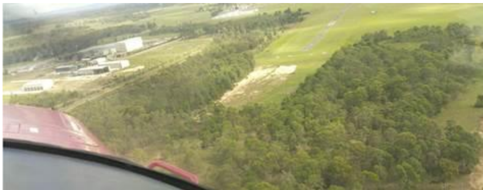
This time, the forced landing with a southerly cross wind...

The comp was followed by a BBQ and salad, it was great. Thank you for all who helped with the preparation.