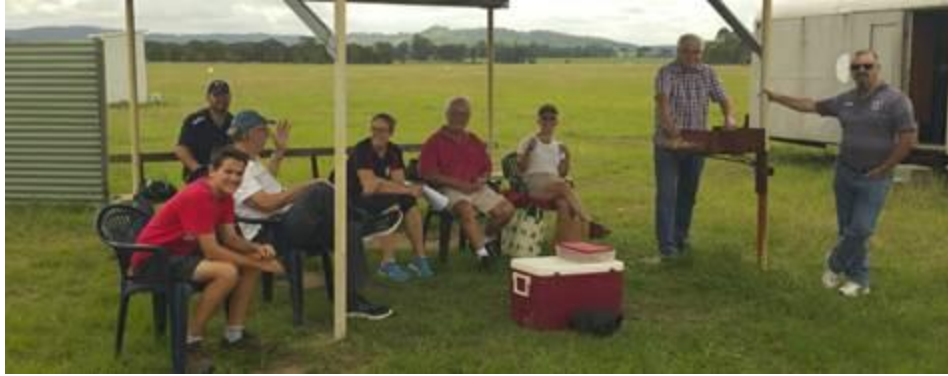
Out on the field...